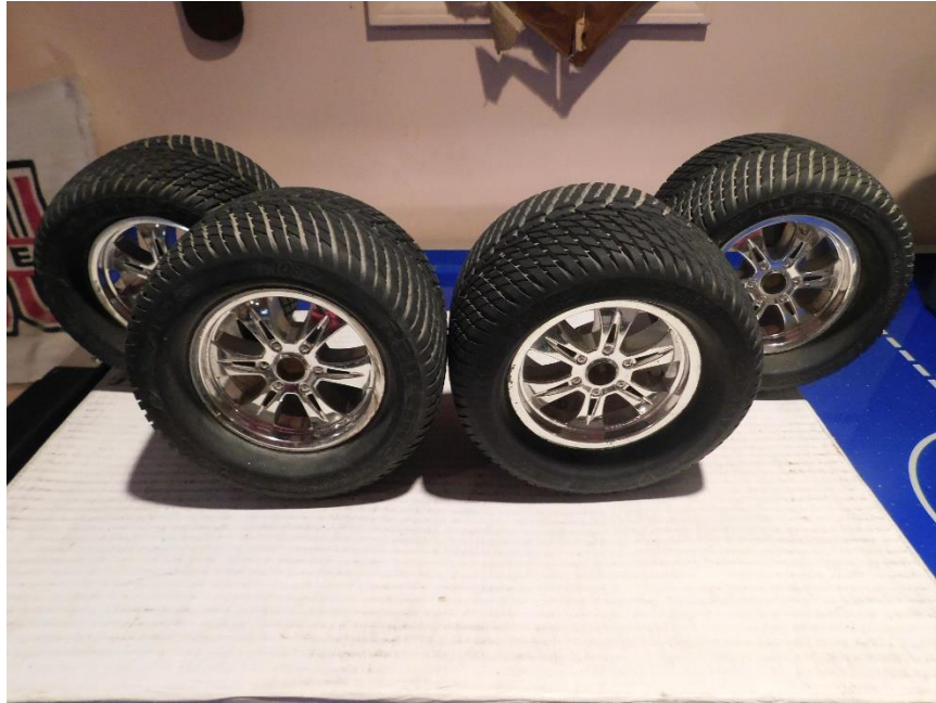
Proline Road Rage tires on chrome rims. $16.00