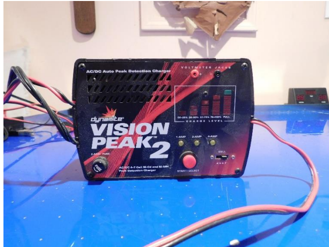
Dynamite Vision Peak 2 AC/DC charger. $15.00