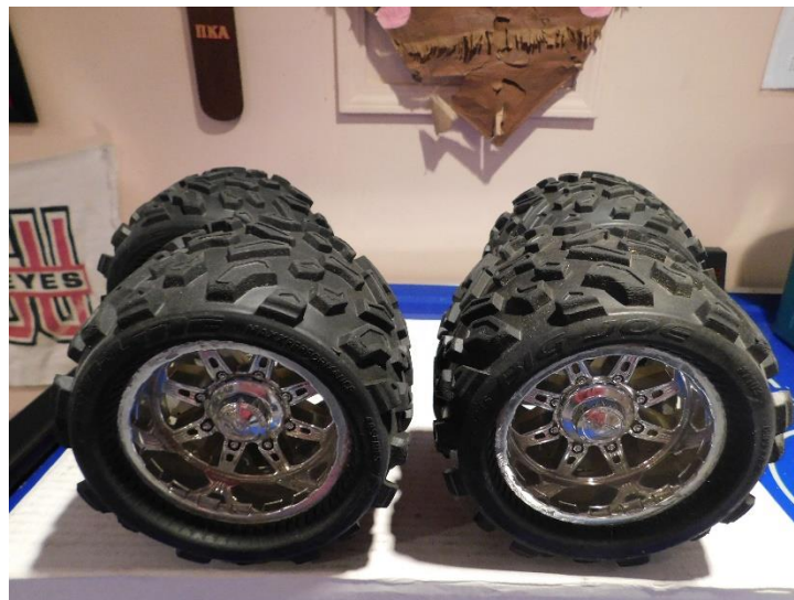
Proline Big Joe tires on chrome rims. $16.00