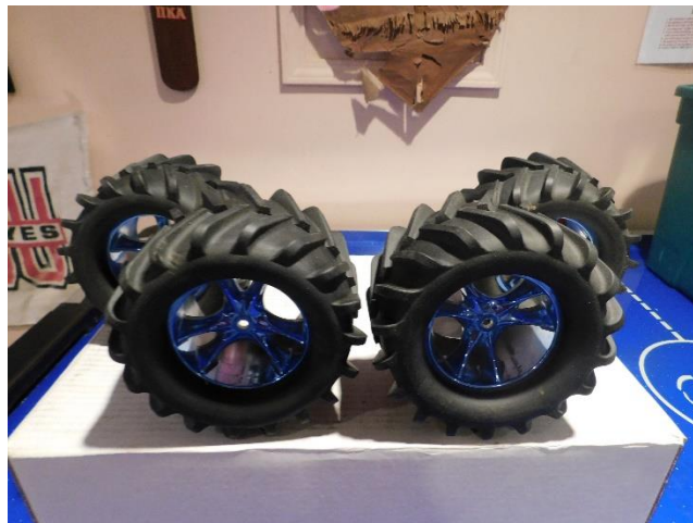
TMaxx tires on blue rims. $8.00.