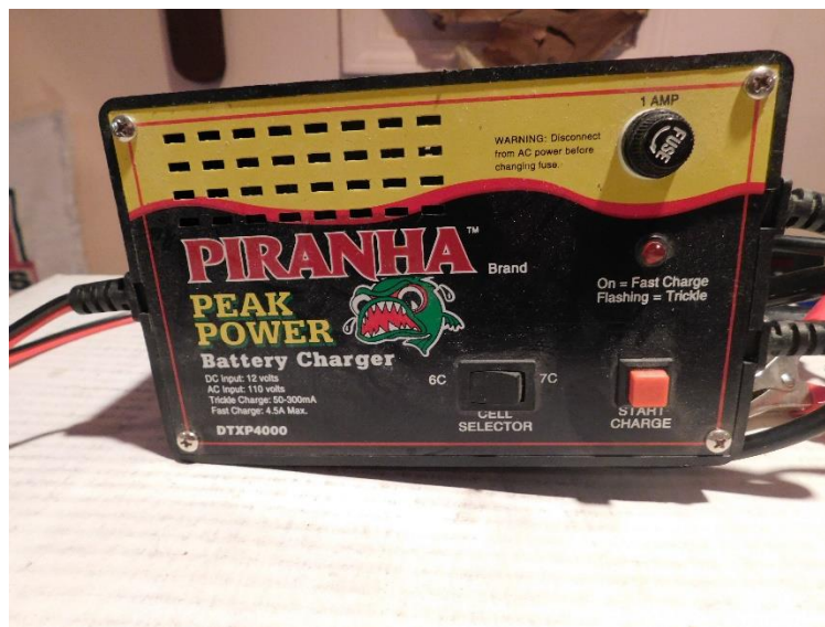
Piranha battery charger $10.00