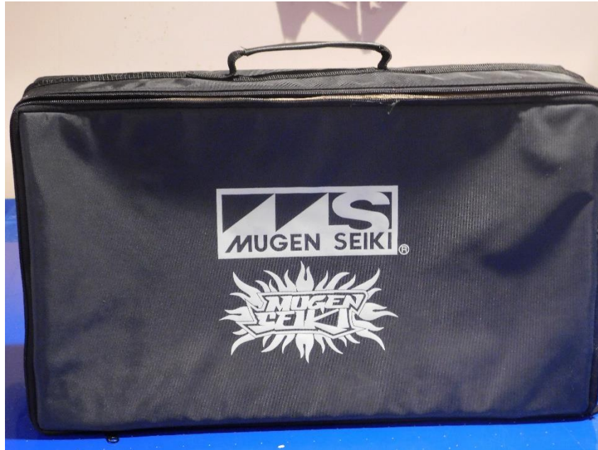
Mugen Seiki buggy/truggy transport case. $10.00