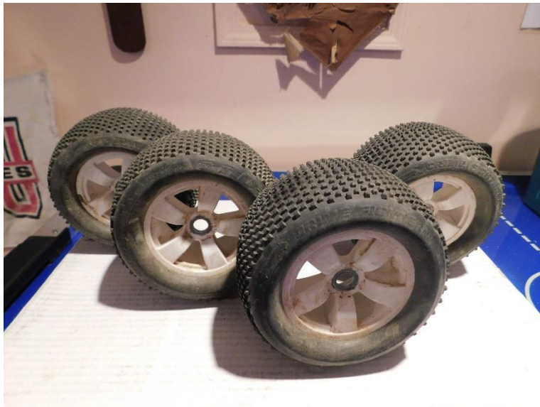
Proline Crime Fighter tires on white rims. $16.00