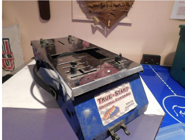
Ofna starter box. $25.00