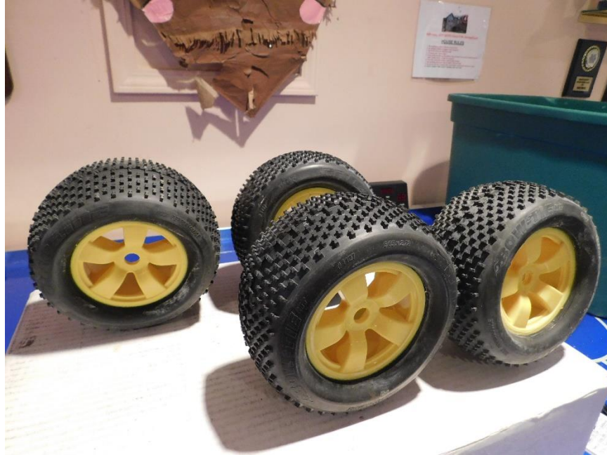
Proline Bow Tie tires on yellow rims. $16.00