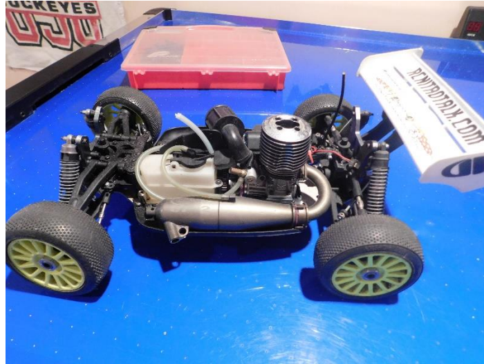
Mugen MBX5 buggy. Comes with Werks P5 .21 engine paired with a Jammin JP2 pipe. Will come with all bodies and spare parts. NO ELECTRONICS INCLUDED. $200.00