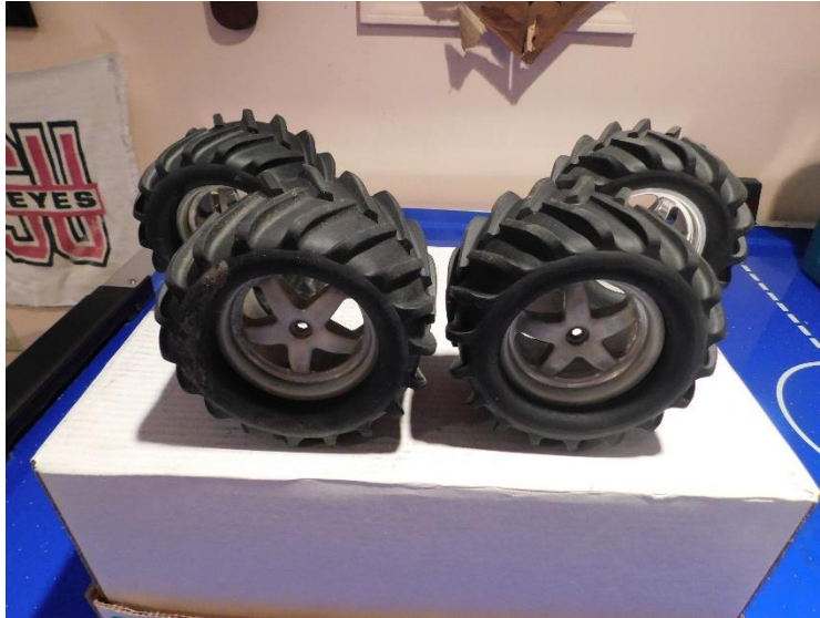
TMaxx tires on silver rims. $8.00