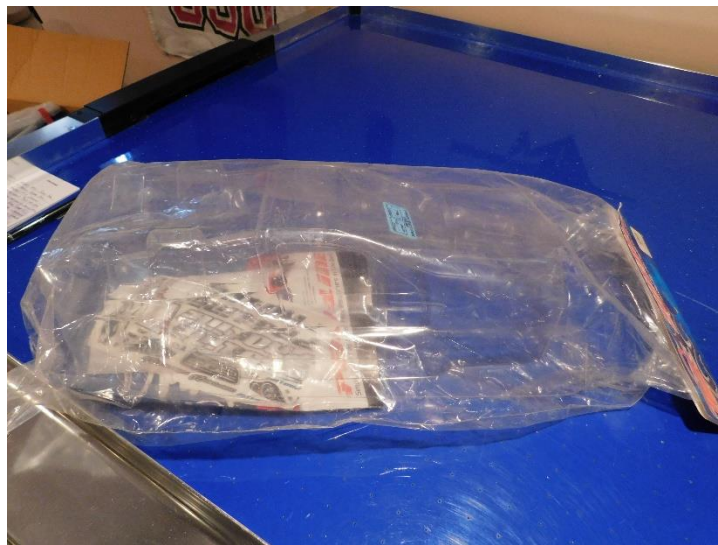
Proline Crowd Pleazer 2.0 NIP body for Mugen MBX5T truggy. $15.00