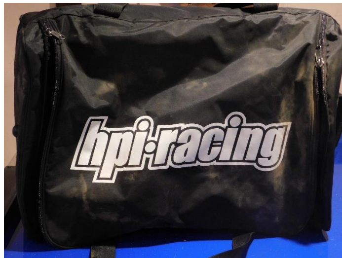
HPI Racing track bag. This bag does roll. $15.00