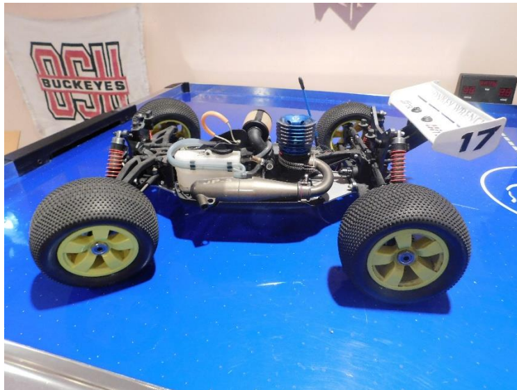
Mugen MBX5T truggy. Comes with an OS VZB Vspec .21 engine paired with a Jammin JP3 pipe. Will come with all bodies and spare parts. NO ELECTRONICS INCLUDED. $200.00.