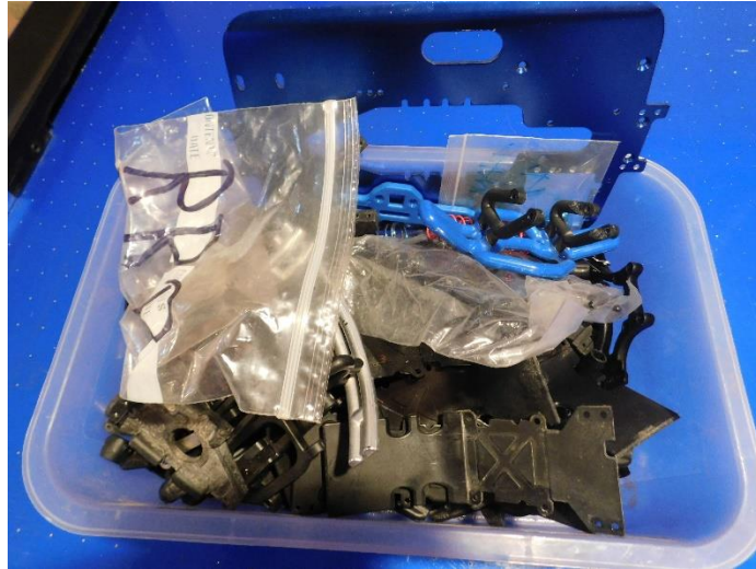
Lot of TMaxx parts. Some RPM parts included. $5.00