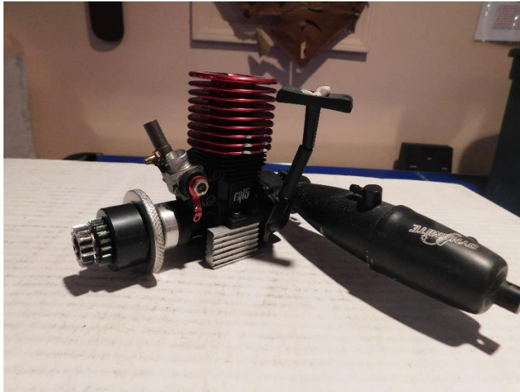
Fantom FR15 .15 pull start engine with pipe. $35.00