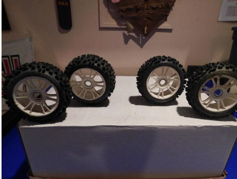
Proline Badlands buggy tires on white rims. $10.00