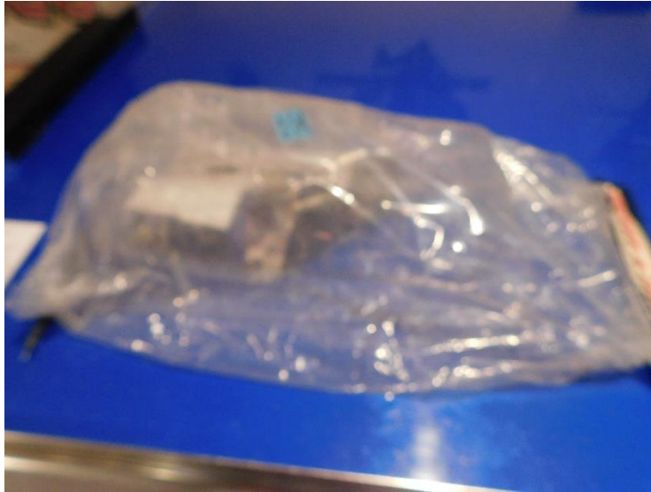
Proline Crowd Pleazer NY NIP body for Losi XXX-NT. $15.00