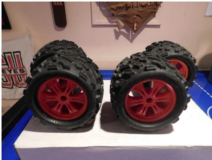
Proline Big Joe tires on orange rims. $16.00