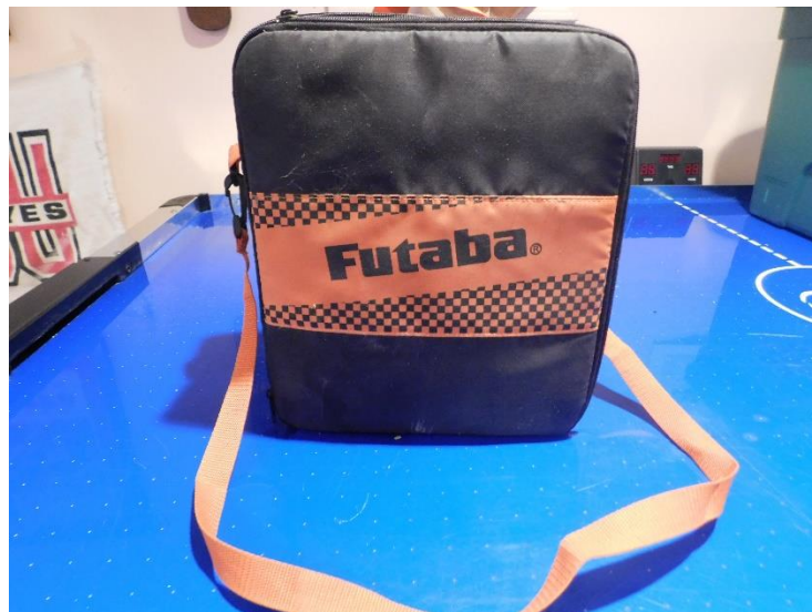
Futaba radio carrier with foam inserts. $7.00